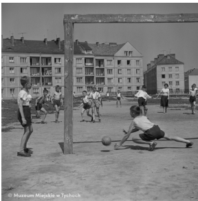
Playing football – abc.tychy.pl MMTy/F/2556