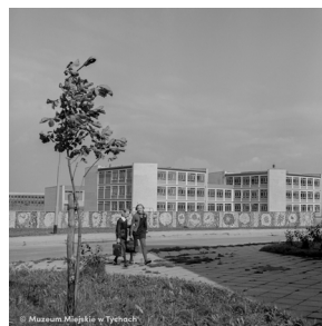
Primary School No. 18 – abc.tychy.pl MMTy/F/2185/1