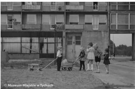
Children with a toy cart and pram MMTy/F/2443