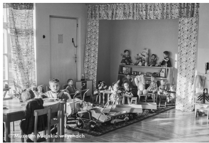
Nursery school meal – abc.tychy.pl MMTy/F/1914/15