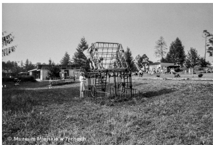
Community festival in Paprocany – abc.tychy.pl MMTy/F/2586/3