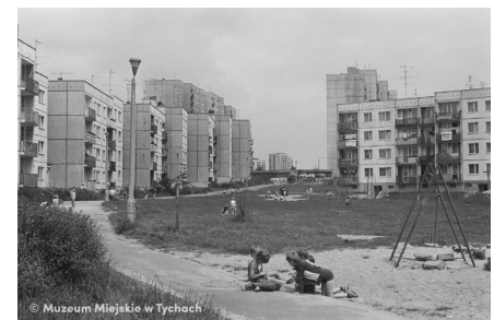
Playground in the T estate – abc.tychy.pl MMTy/F/2225/2