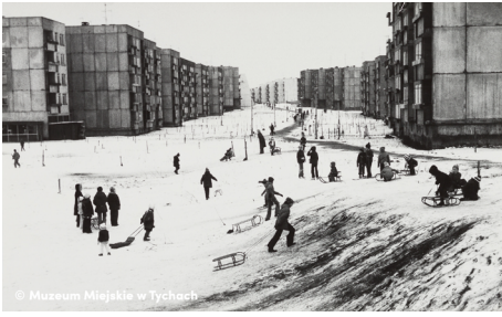
Winter – abc.tychy.pl MMTy/F/541/9