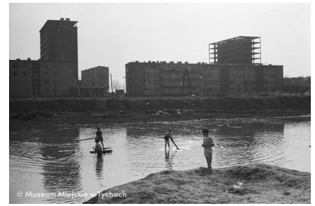
Playing in the water – abc.tychy.pl MMTy/F/1963/2