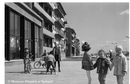
Children play in Housing Estate D – abc.tychy.pl MMTy/F/2098/20