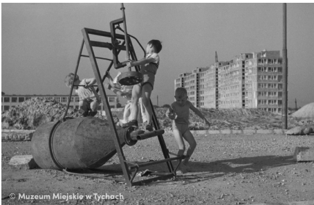
Playing on a concrete mixer – abc.tychy.pl MMTy/F/2440