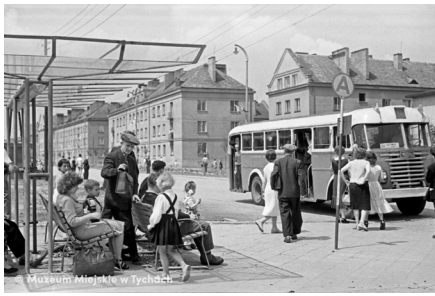
Bus stop – abc.tychy.pl MMTy/F/65/113