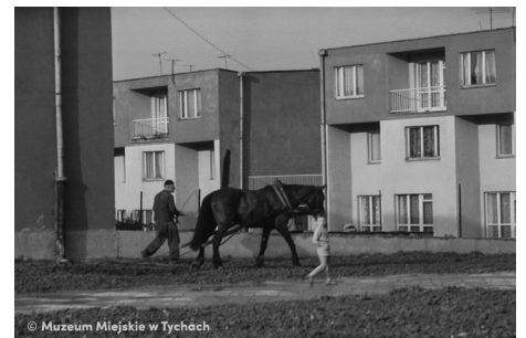
Tidying up with a harrow – abc.tychy.pl MMTy/F/2430