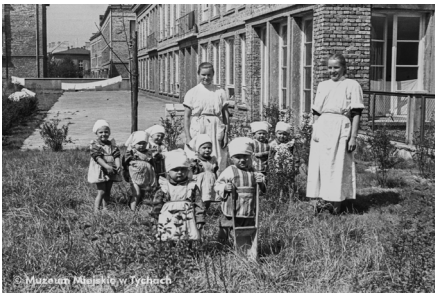
Weekday nursery – abc.tychy.pl MMTy/F/1821/1