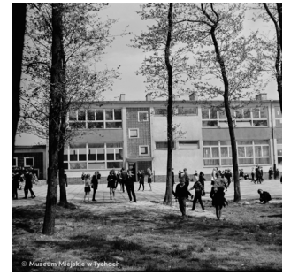
Pupils in front of the school – abc.tychy.pl MMTy/F/2475/1