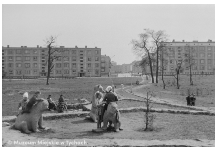
Niedźwiadków Park [Bear-cub Park] MMTy/F/2114/1