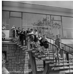
Days of Education, Book and Press – abc.tychy.pl MMTy/F/2505/2