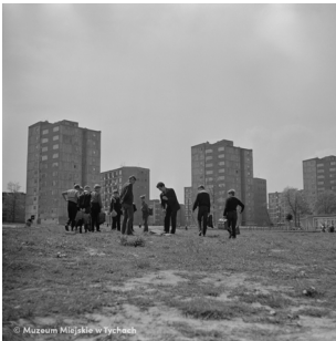
Getting back from school – abc.tychy.pl MMTy/F/2473