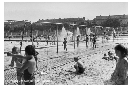
Pool showers – abc.tychy.pl MMTy/F/1913/26