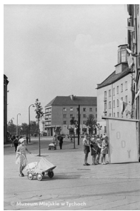
A queue to an ice cream kiosk MMTy/F/1846/5