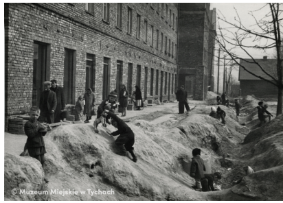
Playing in a pit – abc.tychy.pl MMTy/F/1373