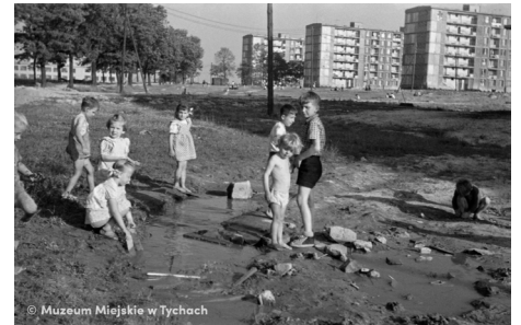
Playing in a puddle – abc.tychy.pl MMTy/F/2438