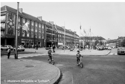
Bolesław Bierut Square – abc.tychy.pl MMTy/F/2597