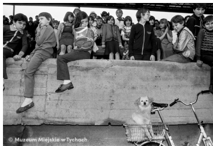
Tychy Youth Encounters – abc.tychy.pl MMTy/F/2578/1