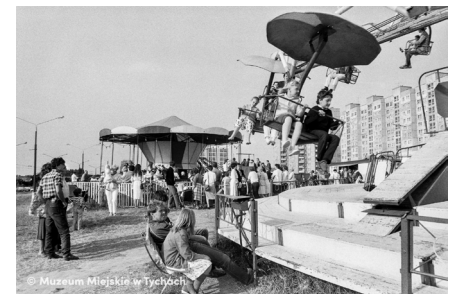
Funfair – abc.tychy.pl MMTy/F/2581/5