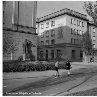
At the Culture Centre in Housing Estate A – abc.tychy.pl MMTy/F/2488