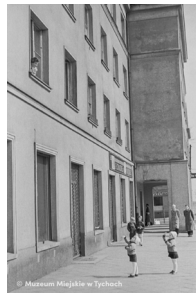
Conversation through the window – abc.tychy.pl MMTy/F/65/99