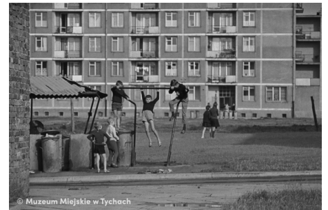
Playing on a carpet hanger – abc.tychy.pl MMTy/F/2422