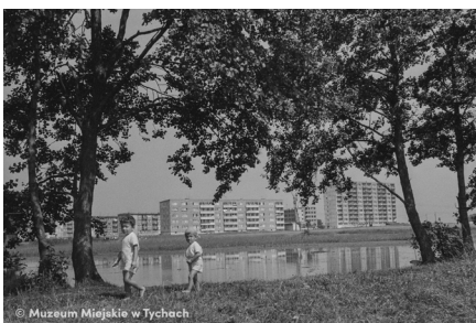
Stroll on the waterfront – abc.tychy.pl MMTy/F/2145/4