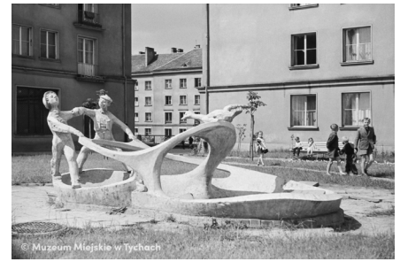
'Boys with a Goose' – abc.tychy.pl MMTy/F/65/72