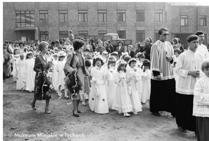
First Communion in St. Christopher's Church – abc.tychy.pl MMTy/F/699/3