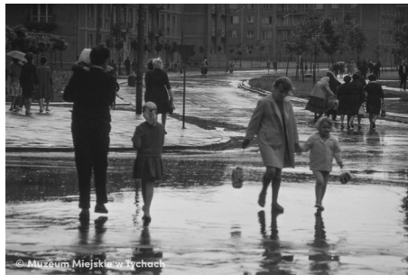
After the rain MMTy/F/2429